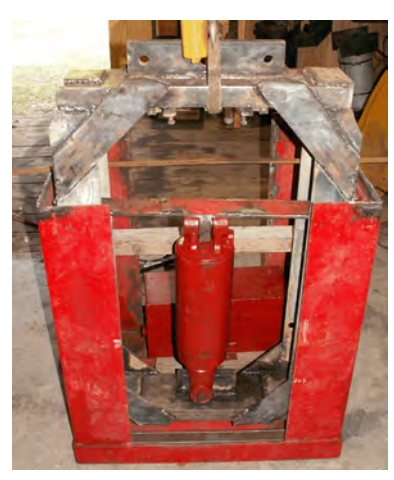
Figure 4: Frame & open cabinet

long) with the upper and lower lintels being 6" wide x 1.75" thick x 24" long The lintel ends were positioned over the I-