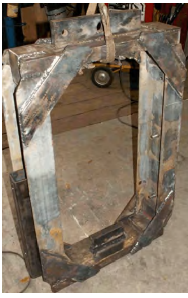
will give an overview of the unit.

I acquired the parts from a horizontal 20-ton press which included the reservoir, pump, motor, gauge, valve, filter and cylinder (5.5" diameter, 7.5" travel) along with hoses and fittings for $200. By the time I bought new hoses and a number of fittings, the damages rose to $450.