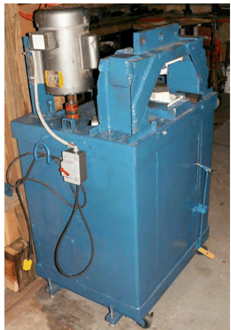
Figure 2: Completed press

extends, the frame sinks into the cabinet until the upper die (attached to the inside center of upper lintel of the frame) makes contact with the lower die. The effort in making the frame is identical to that of an 'H' press and with the castors on the bottom of the cabinet, the whole thing is movable (though like pushing a car!). Figure 2